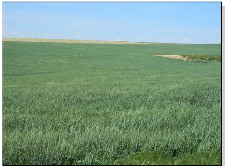
Left: Biosolids application at the farm. Above: Wheat field grown with biosolids.