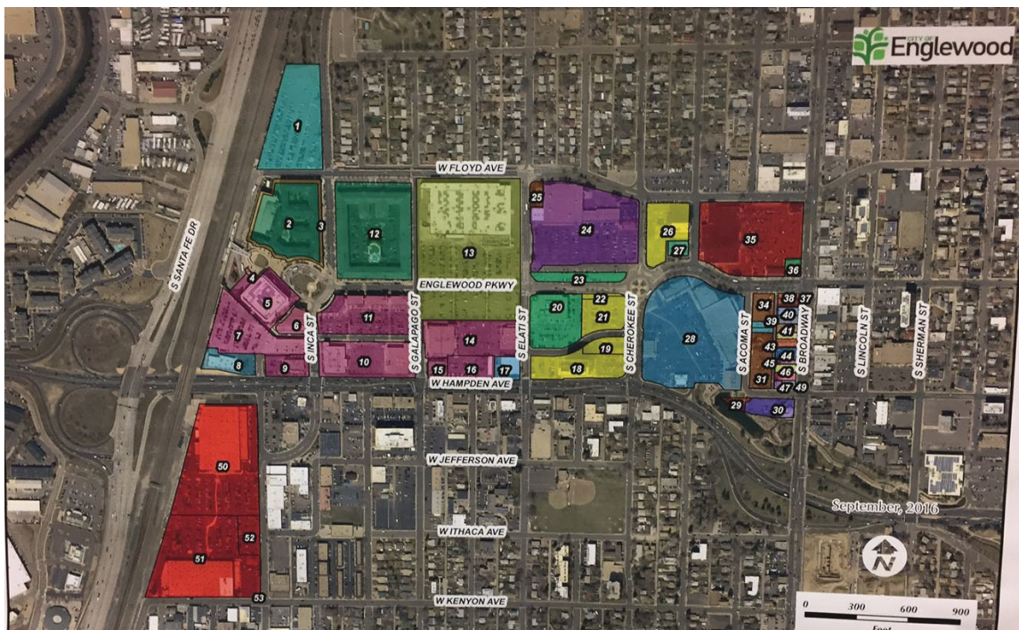
Panelists noted that much of the study area today is a “sea of parking” not conducive to a walkable, mixed-use district.

How to fund and finance all this? Recognizing the city’s fiscal constraints, the panelists recommended the city endeavor to build partnerships with local property and business owners as a framework for future funding mechanisms. Special districts, waivers of development fees, and bond funding are all possibilities.