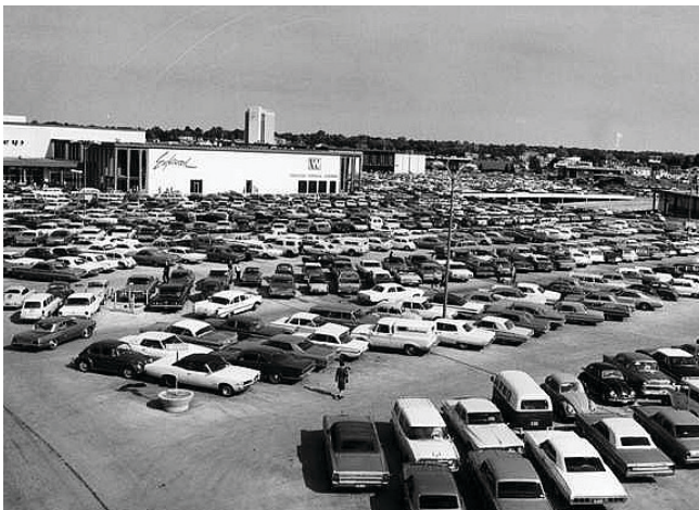
Cinderella City in its heyday as a regional shopping mall.

It follows that Cinderella City was redeveloped into CityCenter Englewood, the first project in Colorado – and one of the first in the country – to replace a distressed shopping mall with a mixed-use transit-oriented development (TOD). The project is centered around a light rail station and Englewood's Civic Center and includes retail, office, residential, and cultural uses