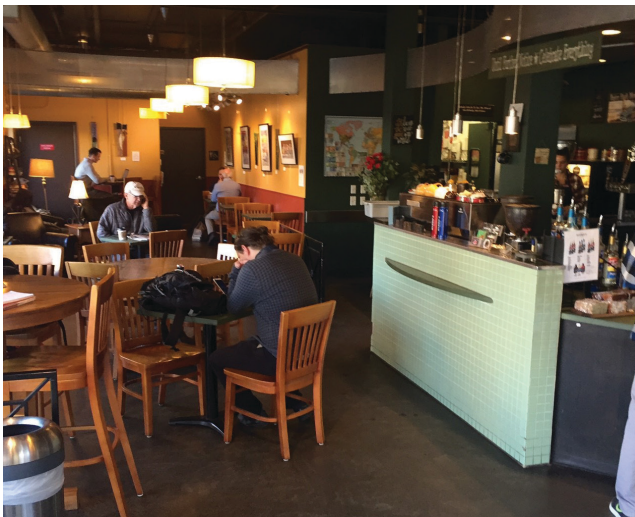
Nixon's Coffee House is one of the few viable 'people draw' businesses in the civic center area.

The key challenge – and the primary opportunity – is to leverage the infrastructure and location with the assets that resulted from redevelopment two decades ago, while correcting shortcomings of developments past.