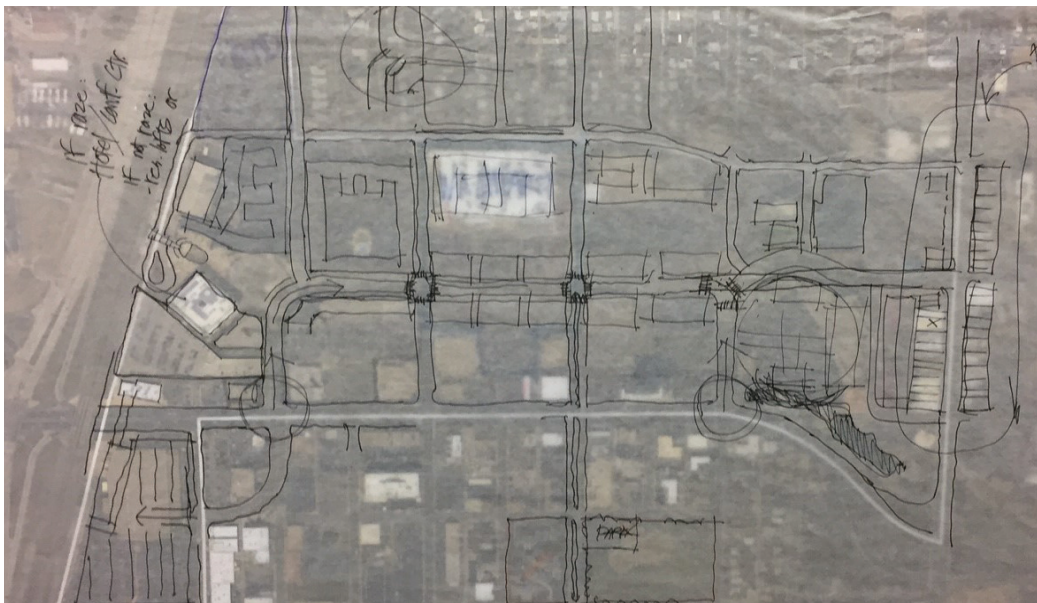
Recasting Englewood Parkway as a walkable Main Street connecting the ‘barbells’ of South Broadway and the RTD station area is critical to the evolution of a mixed-use district. This overlay sketch envisions nodes of activity along the way.

About 70 percent of the study area is surface parking, a number that’s far too high but also offers vast swaths of redevelopment-friendly land. The prime recommendation is the establishment of “park-once district” with structured parking shared by numerous businesses to open up the land for new uses.