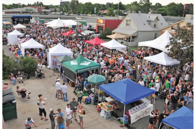
Farmer's markets like this one in Denver help create a sense of community while attracting new interest to a district.

Tweak: Activate Miller Field at Elati Street and Jefferson Avenue and the plaza at Englewood Civic Center with special events like street fairs, farmers markets, and artisan markets, and improved signage and public art.