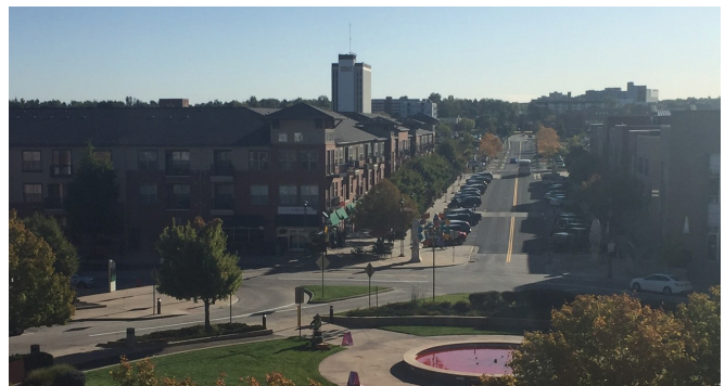
Englewood Parkway should be enhanced with more shade and pedestrian amenities, and made accessible to all users.

The western side of the study area has an inventory of spaces that would be a good fit for artists fleeing increasing rents in the River North (RiNo) Arts District and other creative districts in Denver city limits. The high vacancy in ground-