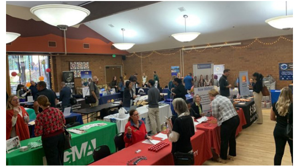
Fall Career Mixer

On October 15, Community Development, in partnership with Arapahoe/Douglas Works, hosted a Fall Career Mixer at the Malley Recreation Center. Over 150 job seekers attended the event, which attracted 25 employers and employment services providers.